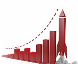
(http://www.venturecapitalnews.us/utm_source=taboola&utm_medium=bytaboola&utm_content=grid-4x2:grid-4x2:) And the Best Stock for 2015 is

taboola_utm_content=organic-text-links-b:Below Article Text Links:)